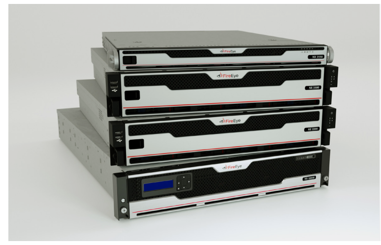
Figure 2. Examples of Integrated Network Security include NX 2550, NX 3500, NX 5500, NX 10450.

malicious traffic and submit suspicious activity over an encrypted connection to the MVX service for definitive verdict analysis