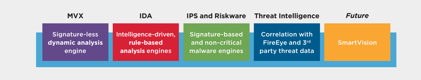
Figure 4. Modular components of FireEye Network Security.