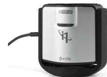
X-RITE COLORIMETER 1 DISPLAY PRO The iDisplay Pro ensures a perfectly calibrated and profiled display while delivering the speed, options and flexibility needed to maintain color accuracy.

*Based on Dell internal testing using included cable and connected to Dell PCs supporting USB 3.1 Gen 2.