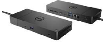
PRECISION THUNDERBOLT DOCK | WD19TB

SMART SOLUTIONS TO HELP YOU WORK MORE EFFECTIVELY.