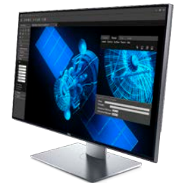
DELL ULTRASHARP 32 8K MONITOR | UP3218K

*CalMAN license required, sold separately