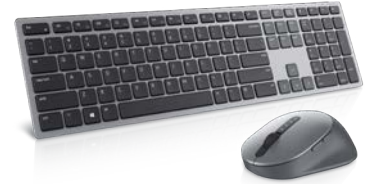
DELL PREMIUM WIRELESS KEYBOARD AND MOUSE | KM7321W

Dell's most powerful dock delivers the ultimate productivity experience for 7000 Series mobile workstations. Charge your system faster, display up to three 4K monitors, and connect your peripherals via a single cable with dual USB-C connectors.