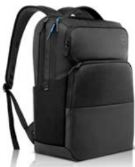
DELL PRO BACKPACK 17 | PO1720P

Experience realistic images like never before on the award-winning, world's first 31.5" 8K monitor featuring Dell PremierColor.