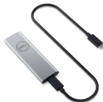
DELL PORTABLE SSD, USB-C 250GB

Protect your notebook and accessories with this lightweight backpack that is made with shock-absorbing EVA foam and Dell's EcoLoop™ solution dyeing process.