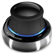
3DCONNEXION SPACEMOUSE WIRELESS

Multi-task seamlessly across 3 devices with this premium full size keyboard and sculpted mouse combo with programmable shortcuts and 36 months battery life.