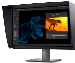
DELL ULTRASHARP 27 4K PREMIERCOLOR MONITOR WITH A HOOD | UP2720Q

3Dconnexion's patented 6-Degrees-of-Freedom (6DoF) sensor is specifically designed to manipulate digital content or camera positions in the industry-leading CAD applications. Simply push, pull, twist or tilt the 3Dconnexion controller cap to intuitively pan, zoom and rotate your 3D drawing.